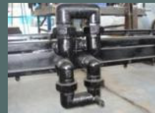
SPRAY BAR BEND

Calibration chart is provided at the operator's platform.