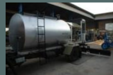
TOP ACCESS LADDER

A ladder and platform is provided for ease of access to the top. A cock is given so that full bitumen tank can be drained out when required.