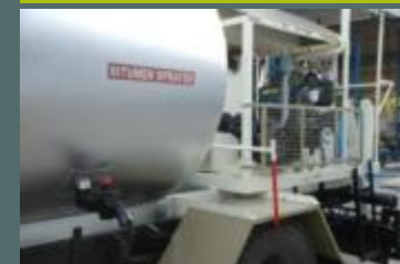
BITUMEN DRAIN OUT COCK